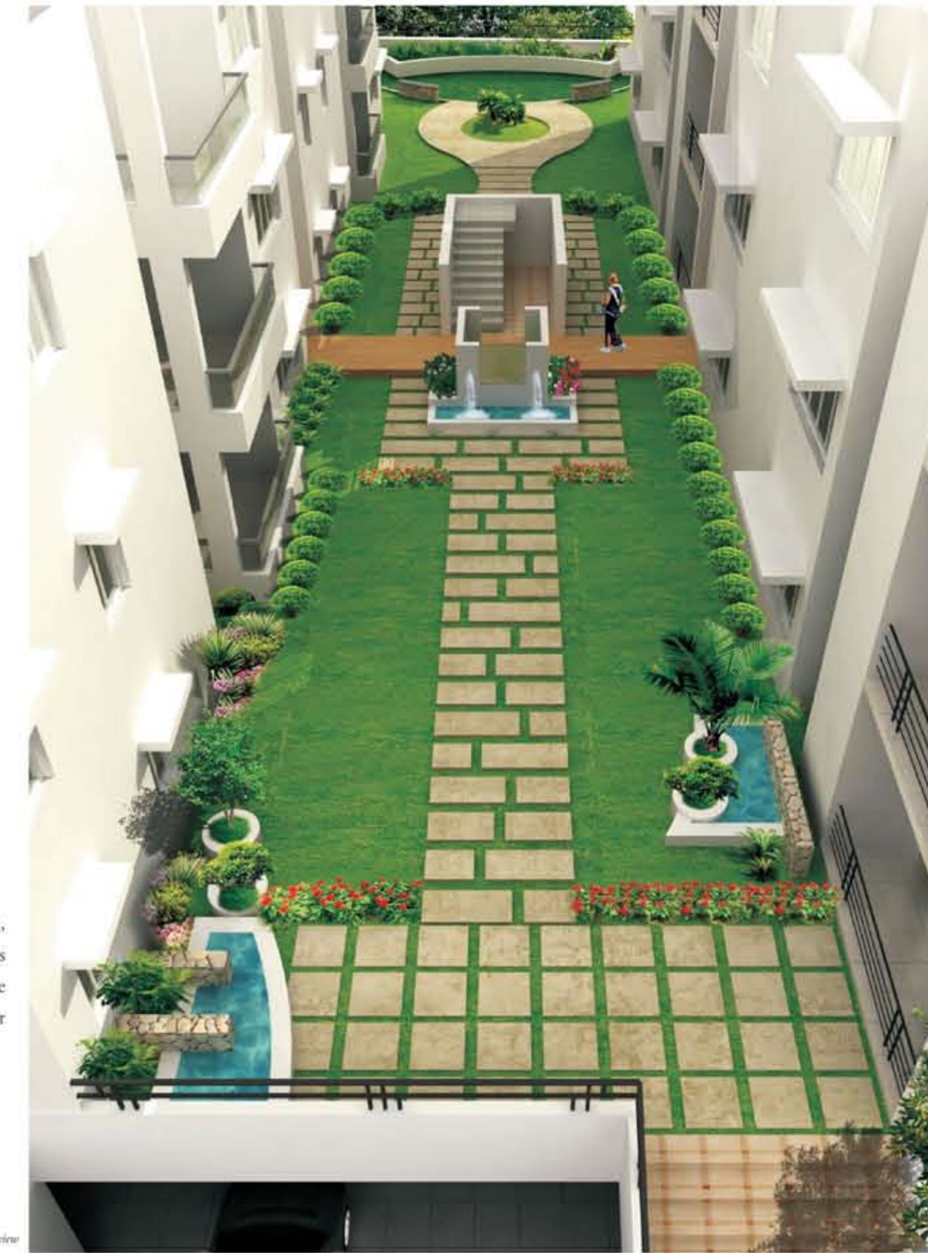
artistic architectural rendering of jyothi lotus landscape view

Jyothi Lotus is enhanced with rich, vivid colours echoing the lushness of greenery planted throughout the premises - an exclusive harbour for body and mind relaxation!